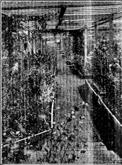
LATH HOUSE VIEW